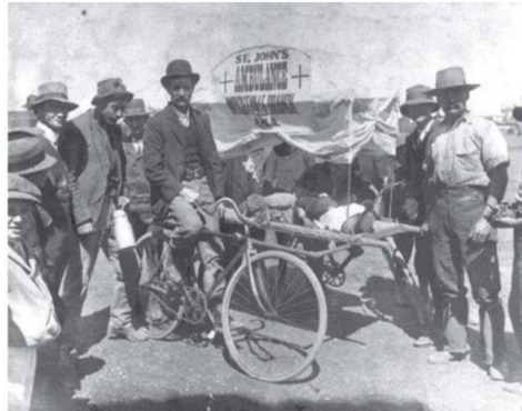
St John Ambulance Brigade 'bicycle ambulance', Cobar- Wrightville Branch NSW (1904). 37

BERT sure looked a little different back in the day!